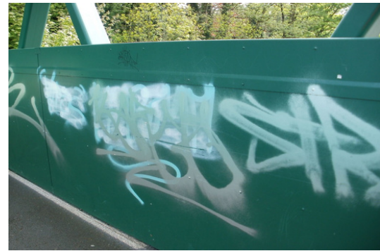
STEEL RAILWAY BRIDGE AFTER APPLICATION OF GREEN NU-GUARD AG THE BRIDGE HAS HAD GRAFFITI SPRAY APPLIED.