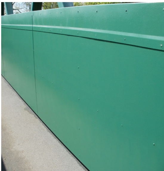
STEEL BRIDGE AFTER REMOVING THE GRAFFITI WITH WATER.