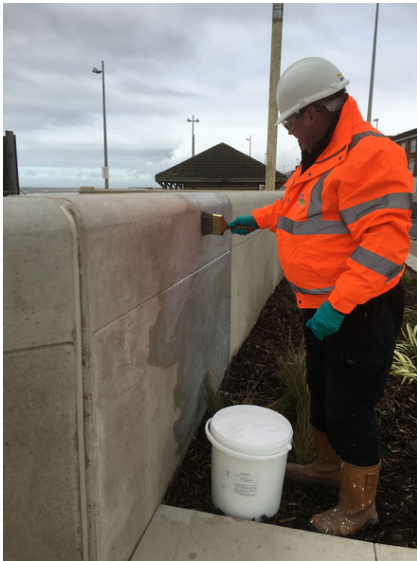
APPLYING THE NON-DARKENING PRIMER ONTO THE POUROUS SURFACE.