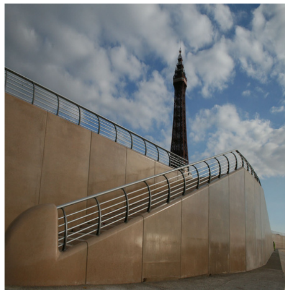
CONCRETE WALLS COATED IN OFF THE WALL ANTI GRAFFITI PROTECTOR. NO PRIMER JUST CLEANED DRIED THEN ONE COAT OF OFF THE WALL GRAFFITI PROTECTOR.